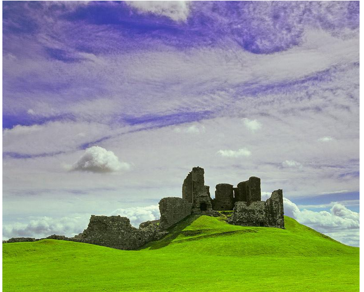
Duffus Castle, Moray, Scotland